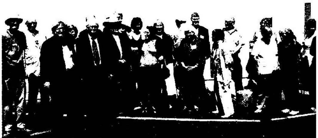
Quakers in Saumur

An international team of historian seekers plunged for the last three years into the Saumur experience of William Penn, collaborating with the Saumur authorities. In celebration of this episode, the Saumur townhall dedicated a square to the future founder of Pennsylvania on May 20th, 2011. This was a very moving and exciting experience.